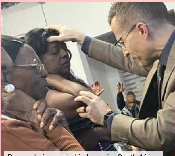
Prayer during revival in Lenasia, South Africa

Greetings from Lenasia, South Africa. We are privileged to