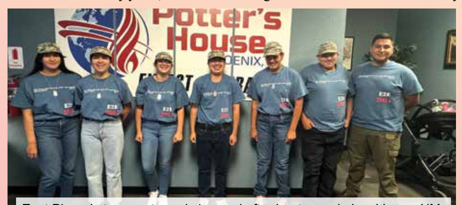
East Phoenix teens returned changed after bootcamp in Las Vegas, NM

We kicked off the spring with our annual Easter Egg Hunt. The highlight of this outreach was the amount of help we got from our new converts. Many