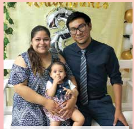
Guadalupe, Mexico couple and their miracle baby

For the year 2023 we had the brothers from Nuevo Laredo who helped us with evangelization and a concert in the church. We had seven visitors.