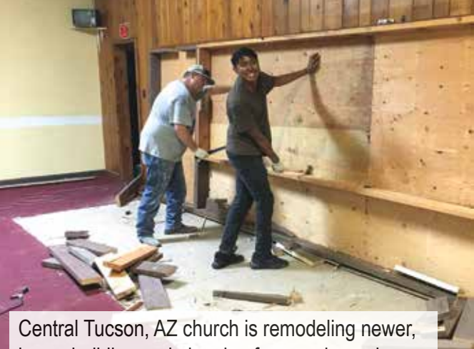
larger building and planning for grand opening

We see God building his church, and we are excited to be a part of it. We are seeing the fruit that we have