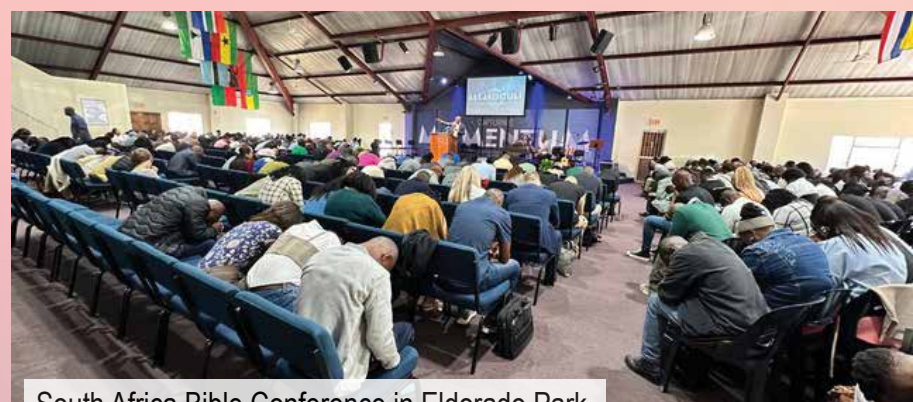
South Africa Bible Conference in Eldorado Park

We thank God and our Fellowship for imparting this vision and then in-