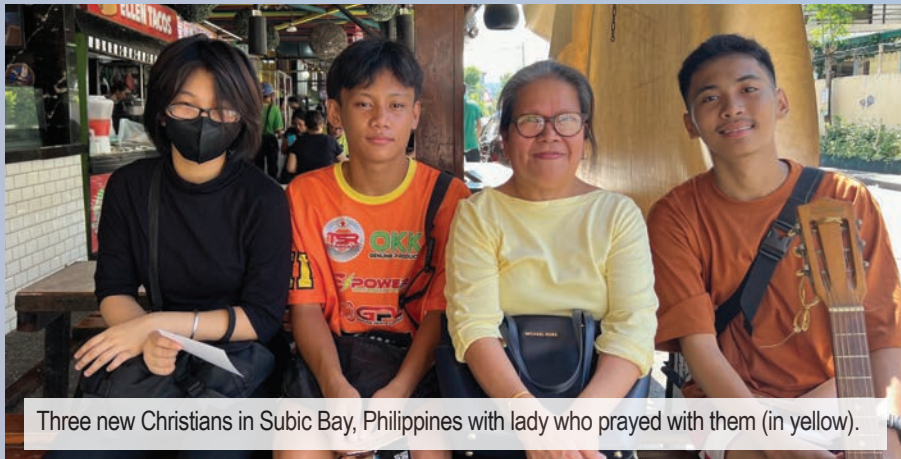
Three new Christians in Subic Bay, Philippines with lady who prayed with them (in yellow).

In October we had our first water baptism with eight people making a public confession of faith and six people filled with the Holy Spirit