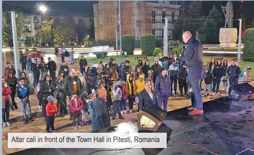
Altar call in front of the Town Hall in Pitesti, Romania

We couldn't wait to come to church every time. I gave up the circle and friends I had before coming to the church. We were so blessed in our prayers, and Jesus blessed us in everything we asked. We had victory in our finances. We have changed in our behavior both in our family and in society. We no longer curse, gossip and judge people. We are living the most beautiful period of our