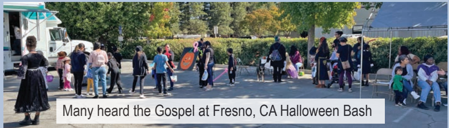
Many heard the Gospel at Fresno, CA Halloween Bash

In October we had our annual Halloween Bash along with a Blood Drive. Local heroes, the Fresno Fire Department, Fresno Police Department, and McGruff The Crime Dog joined us. Vis-