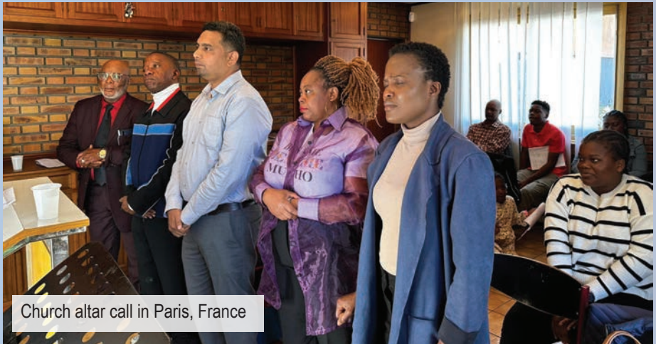
Church altar call in Paris, France