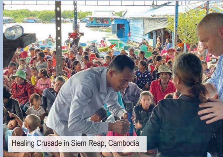
Healing Crusade in Siem Reap, Cambodia

We are very grateful for the Prescott church, the Glendale church, and the Sierra Vista congregation. Furthermore, we are grateful for all the investment in our church from around the Fellowship, including all the churches in Cambodia and all those