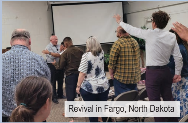
Revival in Fargo, North Dakota

with the attendance and so we are in the process of searching for a larger building!