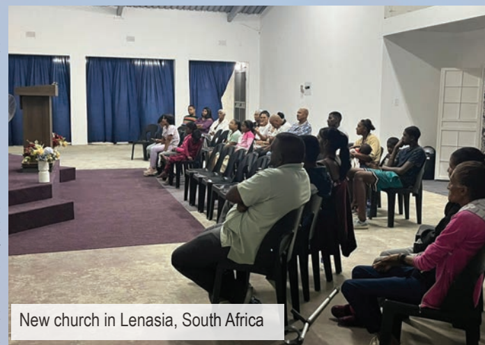
New church in Lenasia, South Africa

God is starting a great church in Lenasia, South Africa.