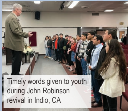
Timely words given to youth during John Robinson revival in Indio, CA

we lay hold of the prophetic words that were given during July conference regarding a fruitful harvest to come in California. Please pray for California and the Indio congregation as we strive to “keep the main thing the main thing!”