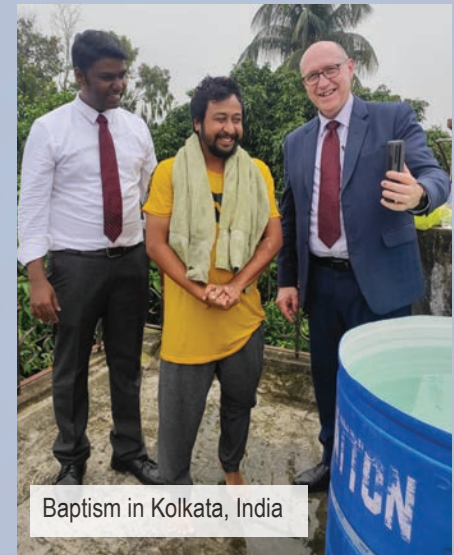
Baptism in Kolkata, India

Please pray for us and support us as we win Kolkata for Christ