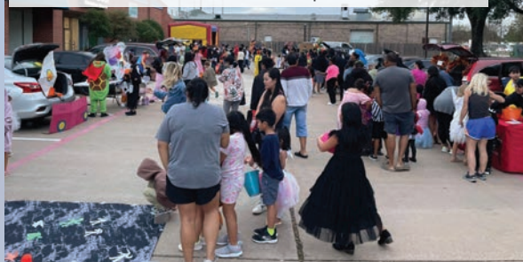
More than 400 people attended Katy Church 2023 Trunk or Treat, and heard the Gospel

testimonies were shared and many gave their lives to Christ.