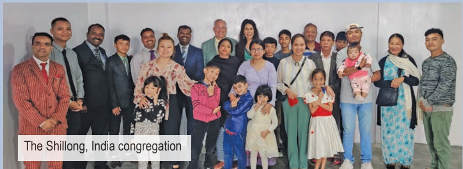
The Shillong, India congregation

I decided to go to the church and I also chose to be saved from the first day. And then I understood what made my wife so happy. Jesus who was in the church. After two weeks I quit smoking, although I had tried countless times, without success. I started reading the Bible and praying every day, and our life changed radically. We communicate much better, we speak with respect, we take care of each other. I am no longer jealous of my wife, even though I was 29