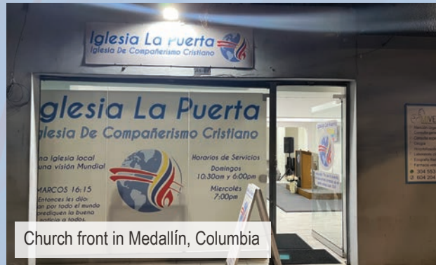
Church front in Medellín, Columbia