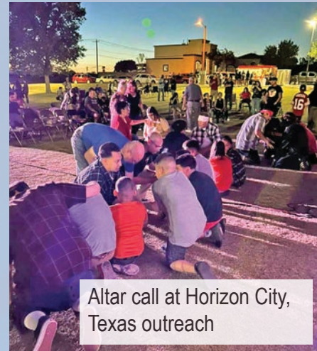
Altar call at Horizon City, Texas outreach