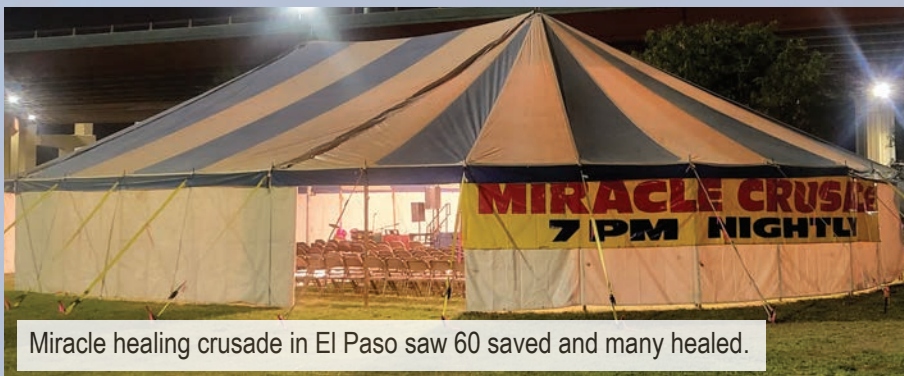
Miracle healing crusade in El Paso saw 60 saved and many healed.

One young man came in after being befriended and witnessed to at college and got radically saved. Soon after, his girlfriend came to church, she also got saved. They became convicted about their living situation and decided to live separately for three months and then we were able to marry them in a glorious Jesus People wedding this past May! They are now both in ministry, on fire for God and they have been inviting other young converts over for dinner, personally investing time and effort into seeing other people live for God.