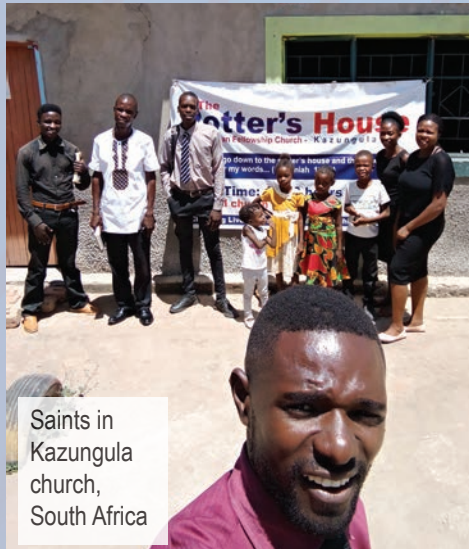
Saints in Kazungula church, South Africa