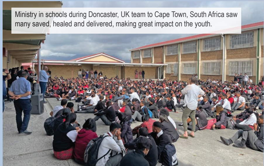
Ministry in schools during Doncaster, UK team to Cape Town, South Africa saw many saved, healed and delivered, making great impact on the youth.