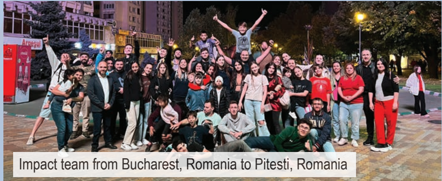
Impact team from Bucharest, Romania to Pitesti, Romania