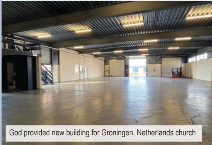
God provided new building for Groningen, Netherlands church