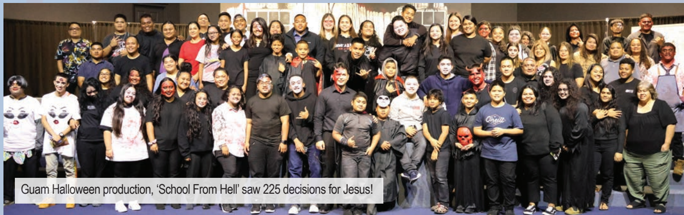
Guam Halloween production, 'School From Hell' saw 225 decisions for Jesus!

turn back to their respective harvest fields in order to sow and reap once again. Truly the touch of the Master's Hand was upon us, as His grace and ministry redirected lives through the preaching of timely messages.