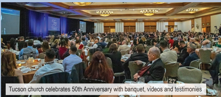
Tucson church celebrates 50th Anniversary with banquet, videos and testimonies

We celebrated our 50-year anniversary with a banquet dinner celebration. Highlighting the night were two video presentations. One video