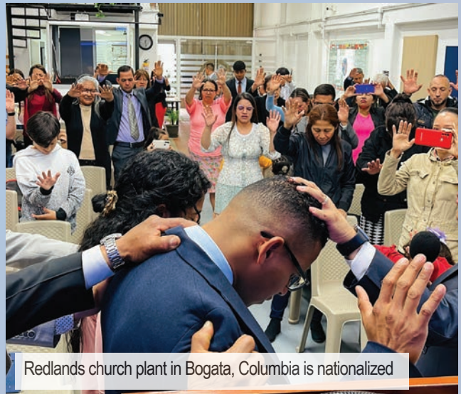
Redlands church plant in Bogota, Columbia is nationalized