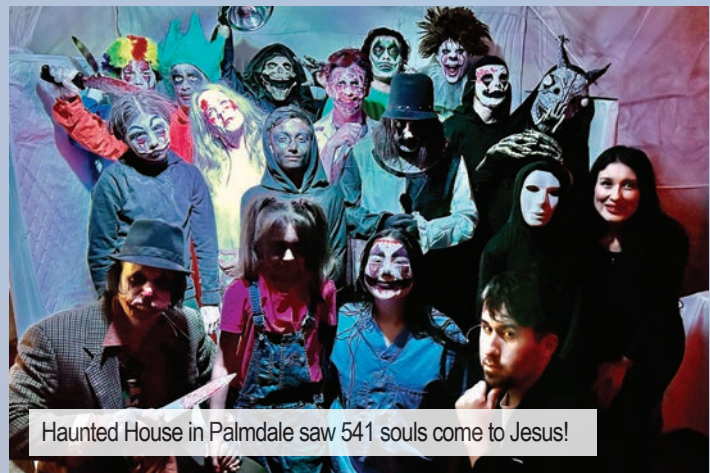
Haunted House in Palmdale saw 541 souls come to Jesus!

We're looking forward to partnering with Redlands as they help us with our first outdoor crusade in downtown Palmdale. Praying for a supernatural outpouring in the Last Days.