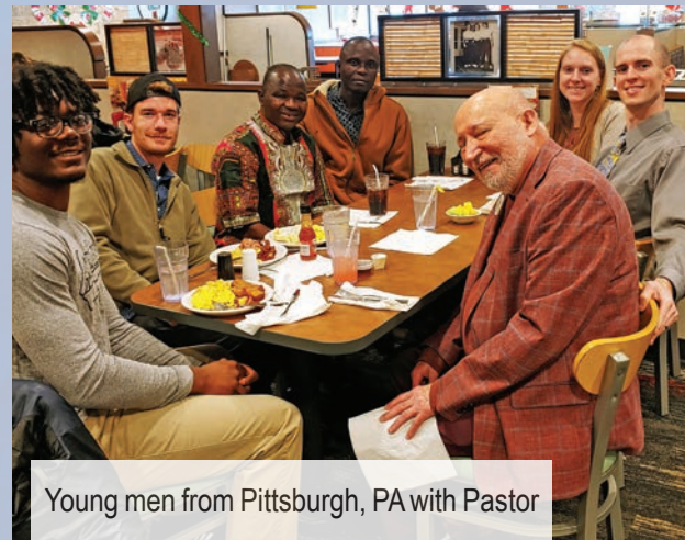
Young men from Pittsburgh, PA with Pastor

We're praying for some new jobs for a few guys because they want to get more involved! Pray for Pittsburgh, it's a great city, people are opening up, and we can take a few more pioneers!