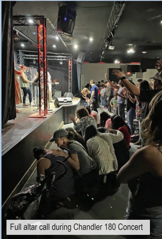
Full altar call during Chandler 180 Concert

Our Trunk or Treat event was effective with more than 400 visitors.