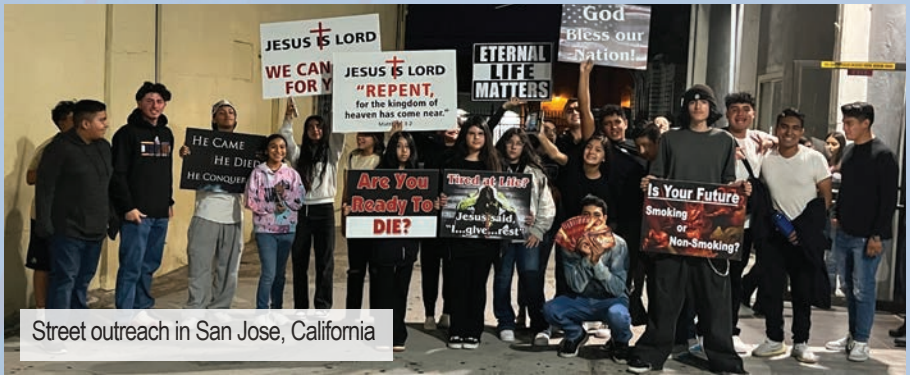
Street outreach in San Jose, California

The Neon Lights team also made their way up to Canada in September for the Mississauga and Whitby churches. This was a great time of connecting with these neighboring congregations and opened the door to a number of connections for those churches.