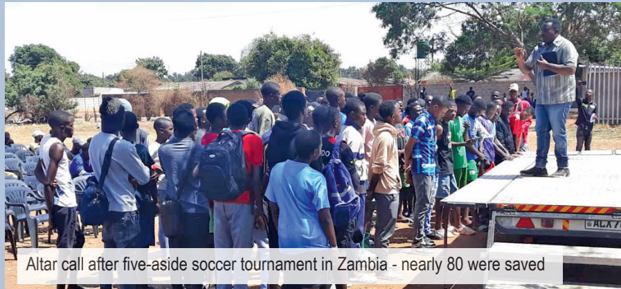
Altar call after five-aside soccer tournament in Zambia - nearly 80 were saved

bassis hosted our annual Central African Bible Conference themed "The Unfinished Task" during which Pastors Jeff Day and Jonathan Heimberg were guest preachers.