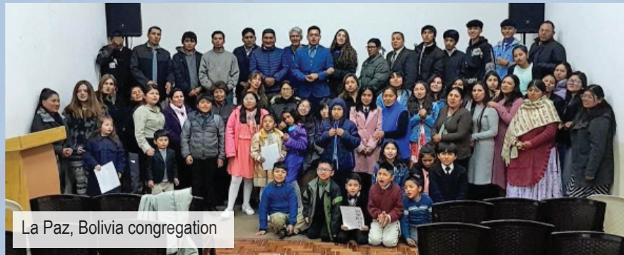
La Paz, Bolivia congregation