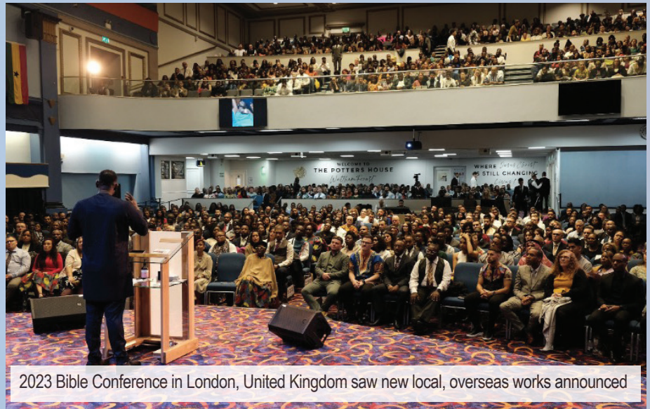
2023 Bible Conference in London, United Kingdom saw new local, overseas works announced

In the month of October, we held the 2023 annual Bible Conference, which drew in all our missionaries to be strengthened and stirred to re-