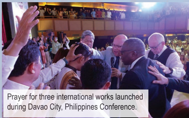
Prayer for three international works launched during Davao City, Philippines Conference.

We recently concluded our second Davao Bible Conference for this year. It was a tremendous week, from the preparations early on to our prayer and