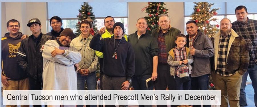
Central Tucson men who attended Prescott Men's Rally in December