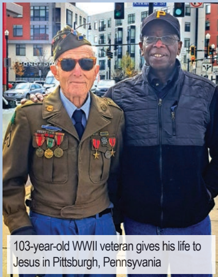
103-year-old WWII veteran gives his life to Jesus in Pittsburgh, Pennsylvania

We have seen the sovereign hand of God move in so many different dynamics as we press into the kingdom of God. We have continued the time proven method of bringing the Gospel message outside the four walls of the