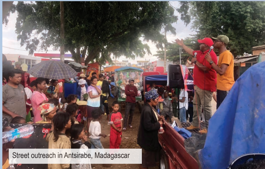
Street outreach in Antsirabe, Madagascar

In Antsirabe, we started off with a marriage seminar for our couples here. Twenty-six couples came and God spoke a word in season to their marriages. Six couples were visiting and they all got saved! We followed that up with doing street meetings in