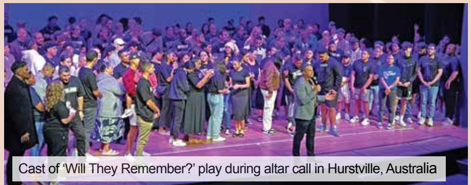
Cast of 'Will They Remember?' play during altar call in Hurstville, Australia

In January, we also had an impact team from Auckland, New Zealand. They came to the Hurstville church