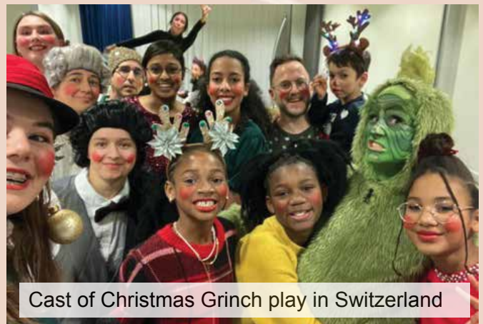
Cast of Christmas Grinch play in Switzerland