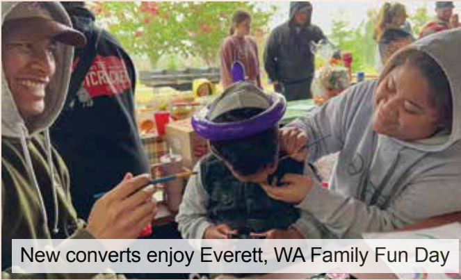
New converts enjoy Everett, WA Family Fun Day

the end of the year God did THAT and so much more! We've seen backsliders return, spouses saved, friends and family won for Jesus that are faithfully attending church today and continue to see that even in this new year!