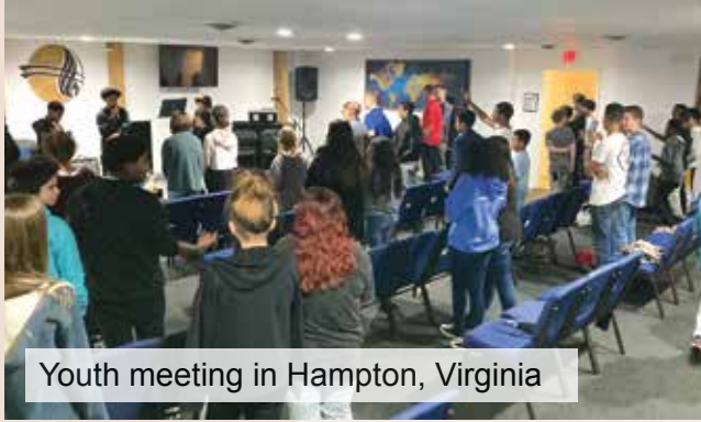
Youth meeting in Hampton, Virginia

Level.” God continues to pour out His Spirit over our church with many souls getting saved and stirred to profess Christ with their lives!