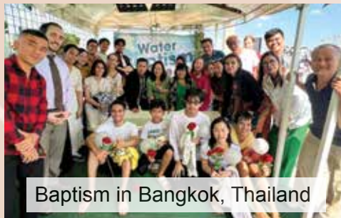
Baptism in Bangkok, Thailand

One lady had been suffering from total deafness in her left ear for 19 years. She was instantly healed. She came back the following night and got baptized by the Holy Spirit.