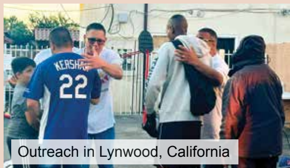
Outreach in Lynwood, California

During the holiday season, we held a Christmas Toy Giveaway and had over 400 visitors come through the rain. Roughly 40 people responded for salvation.