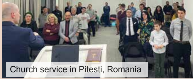
Church service in Pitesti, Romania

the vision you are passing on to the Fellowship of Romania.