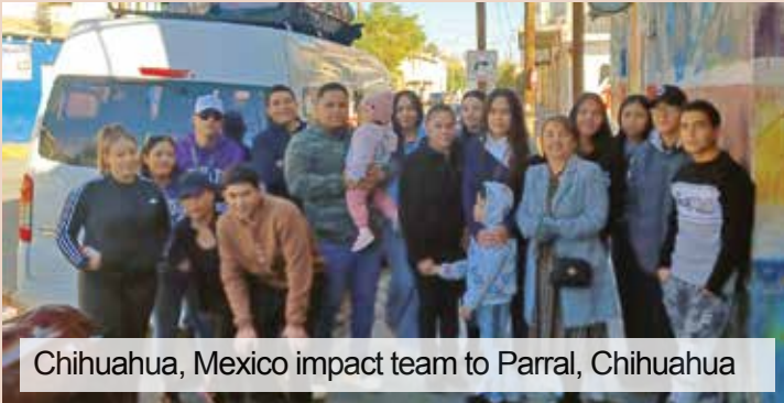
Chihuahua, Mexico impact team to Parral, Chihuahua

gotten saved in the last nine months have decided to start a music group. Praise God! They decided to call it grupo “La Puerta”! As of this writing they are having their first concert this coming Saturday. And, they are also making plans to play in the parks and neighborhoods during the summer months for outreach!