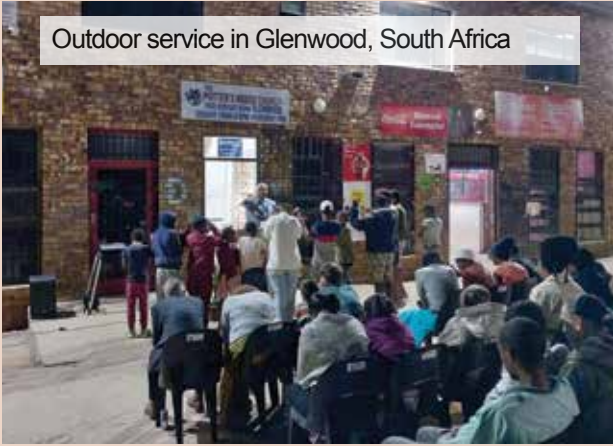
Outdoor service in Glenwood, South Africa

pain for the past two weeks. I can't sleep at night because the pain is too much."