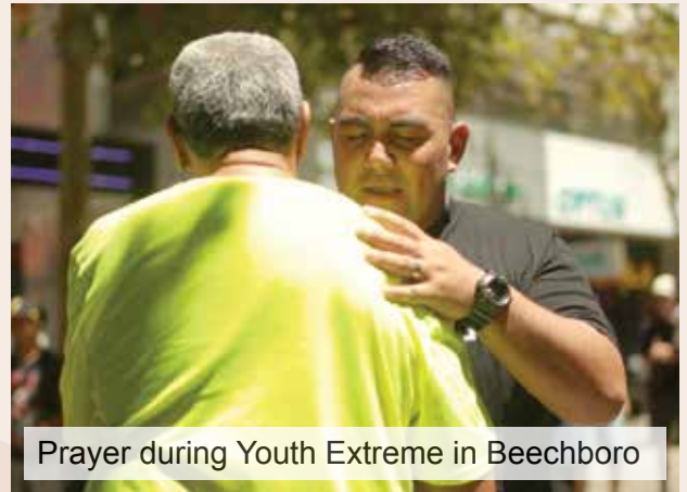
Prayer during Youth Extreme in Beechboro

A notable highlight was our Annual Youth Extreme event which is a full day of evangelism with all the youth from our Western Australian churches. This year we held a youth rally featuring a Holy Ghost challenge