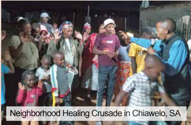
Neighborhood Healing Crusade in Chiawelo, SA

We had record breaking services for the entire month of January with our final Sunday reaching 128 in our morning service with 40 souls saved and 14 baptized. The church is ex-