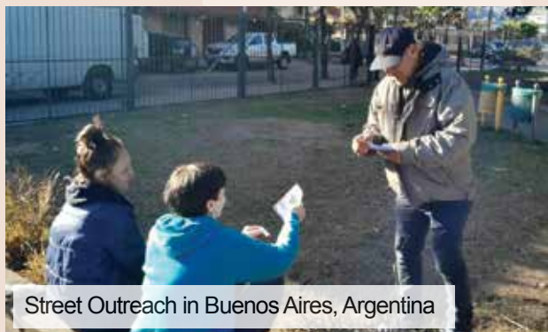
Street Outreach in Buenos Aires, Argentina

In the church of Den Bosch, we are experiencing a revival like we have never seen before.