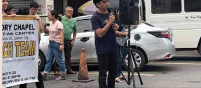
Youth outreach in Davao City, Philippines

nice Christmas-musical with high attendance and several converts. We are looking forward what God will continue to do in our church in 2024.