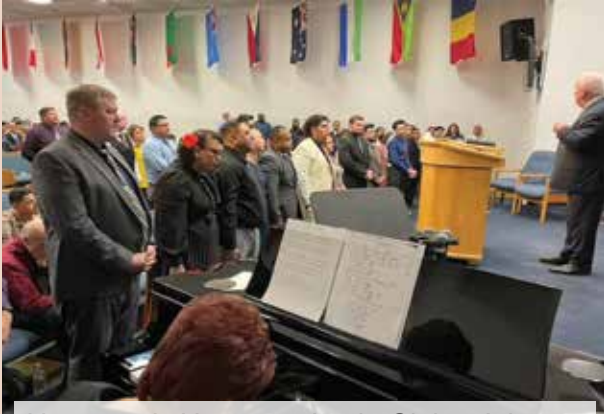
Harvester's Homecoming in Globe, Arizona