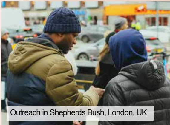
Outreach in Shepherds Bush, London, UK

The latter part of 2023 into 2024 has been a turning point for our Church, and