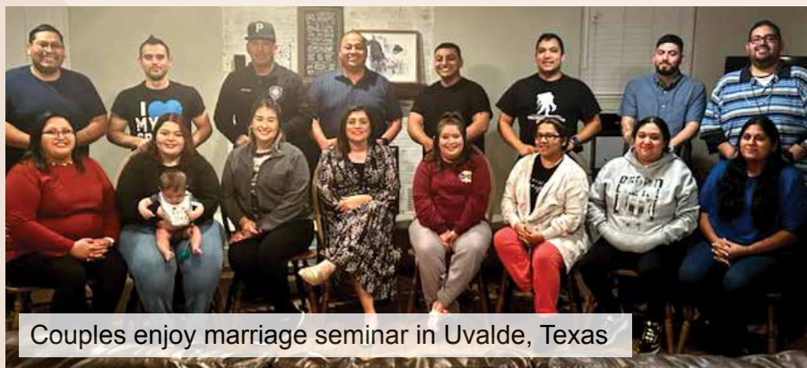
Couples enjoy marriage seminar in Uvalde, Texas

The new year has just rolled in and we have hit the ground running for Jesus! Within these past couple of months God has done a tremendous amount of work here in Uvalde. Many lives are being touched