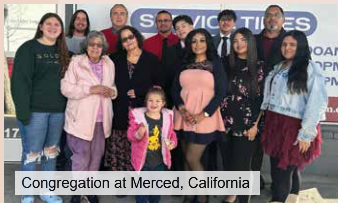
Congregation at Merced, California