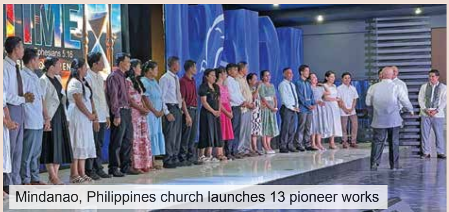
Mindanao, Philippines church launches 13 pioneer works