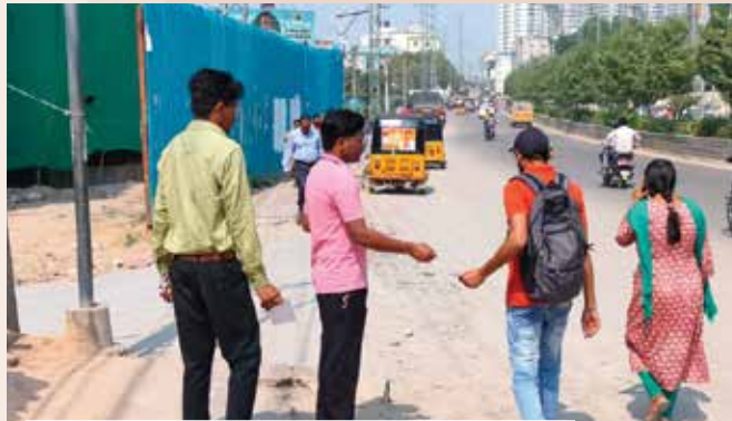
Street outreach in Hyderabad, India

We prayed for a sister's grandmother who was paralysed and was in bed for many days. God healed her completely