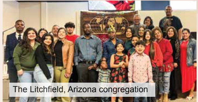
The Litchfield, Arizona congregation