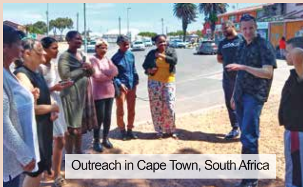
Outreach in Cape Town, South Africa

In the month of January we had a Saturday and Sunday evening Healing Crusade where we saw some visitors and two decisions for salvation. One visitor had a deaf ear and after prayer she could hear