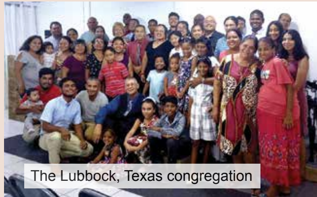
The Lubbock, Texas congregation