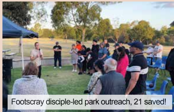
Footscray disciple-led park outreach, 21 saved!

preaching, we sent three bus-loads of bonfire youth to six different churches in the area with many people street preaching, witnessing and praying for people for their first time! Then we held our Christmas Carols event that same evening, which drew a large crowd of visitors with more decisions for Christ.