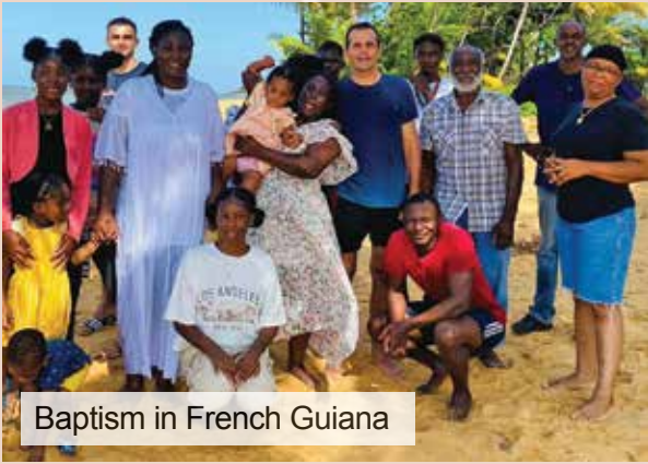
Baptism in French Guiana

Our church goal was to be a 24/7 witness and maintain 24/7 faith.