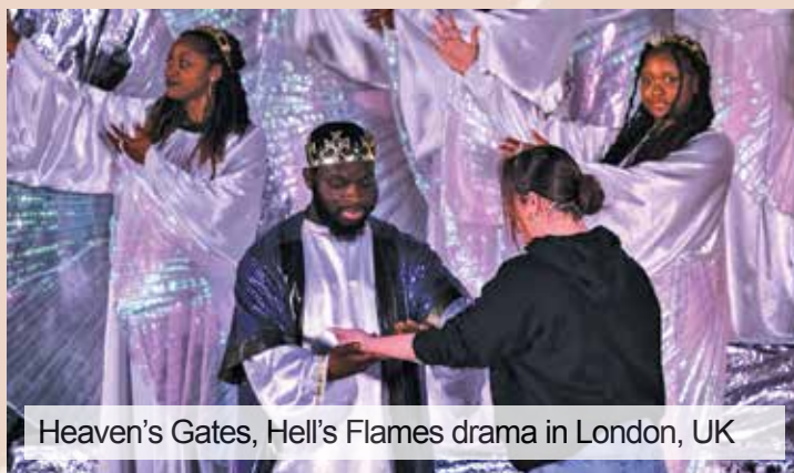
Heaven's Gates, Hell's Flames drama in London, UK