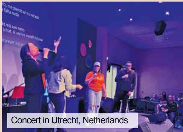
Concert in Utrecht, Netherlands

The city of Utrecht has a beautiful geographical location, we have a lot