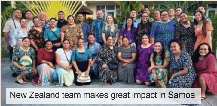
New Zealand team makes great impact in Samoa

As a small nation in the heart of the Pacific - there has been much favor shown to us in 2023! It has been a year of Restoration, Fruitfulness and Reviv-