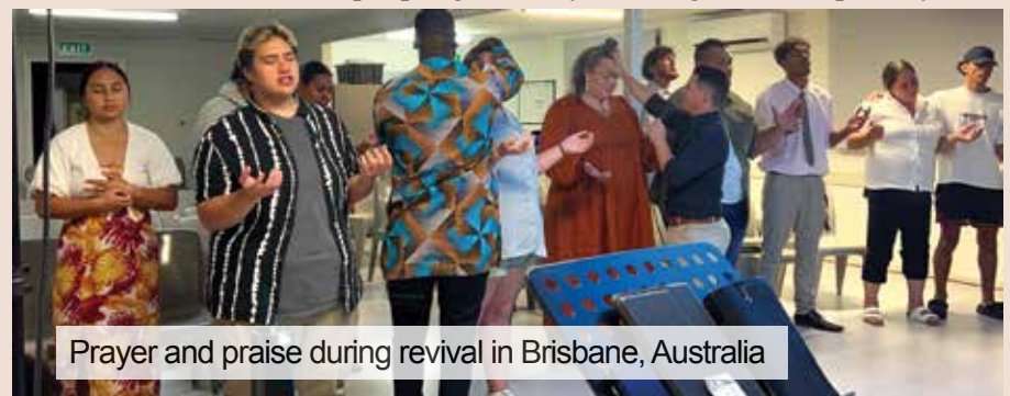
Prayer and praise during revival in Brisbane, Australia

Before the year ended, we had a concert where we had 50 people get